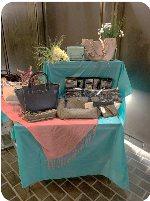
Dress for Success Store

So ladies, bring your donations to our May 1st meeting, and I will be waiting to load up my car. I will be taking the donations the following Monday out to the store.